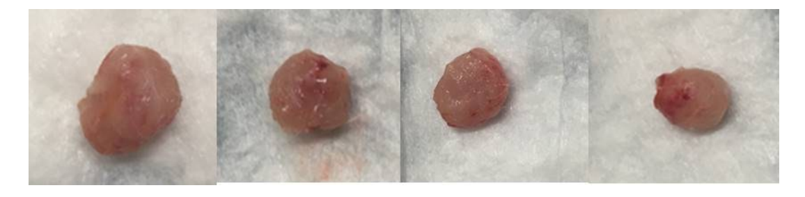
Figure SI 2. Digital images of tumor after different treatment at 7 days. From left to right side, they stand for PBS, PBS with radiation, bismuth nanoparticles without radiation, and bismuth nanoparticles with radiation, respectively.