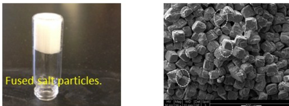
Figure S2. Photograph (left) and SEM image (right) of the prepared salt template. The circles show areas where the salt particles are fused together.