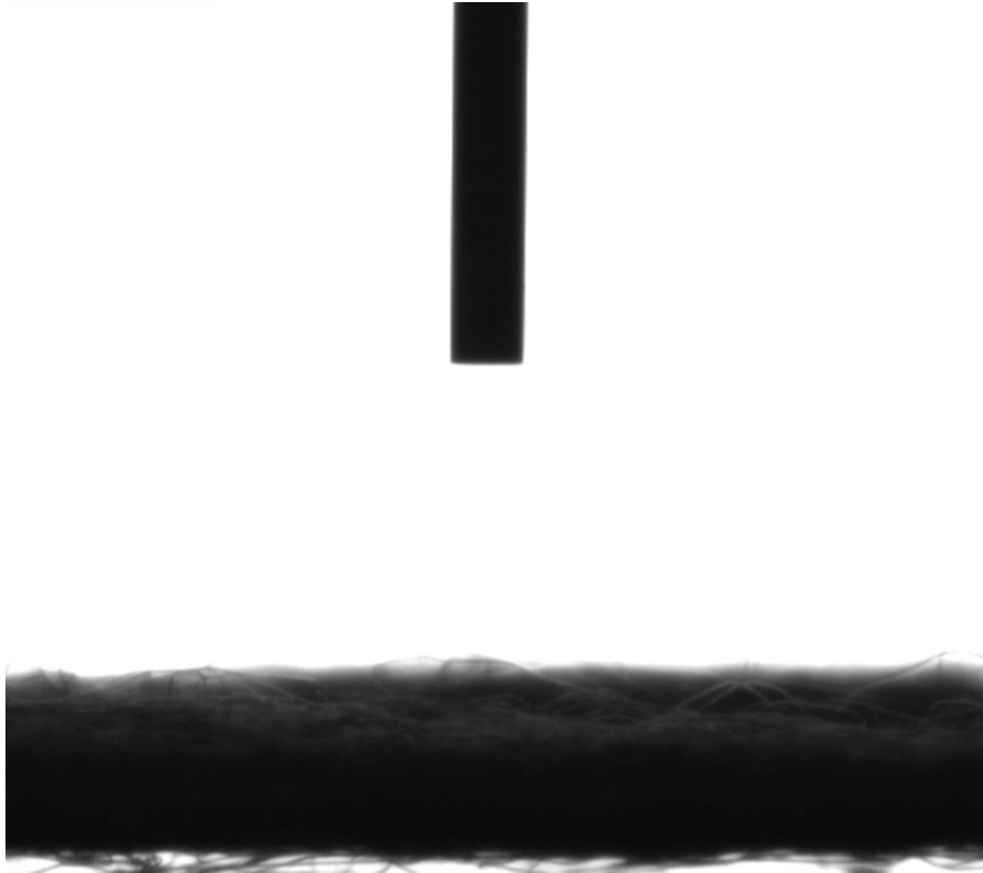
Fig. S1 Photograph of a chloroform droplet on PS/non-woven fabric hybrid membrane with a contact angle of 0^\circ , indicating the well superoleophilicity of the synthetic hybrid membrane.