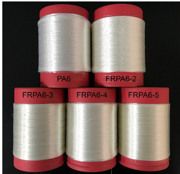
Figure S2. The photograph of PA6 and FRPA6 fibres