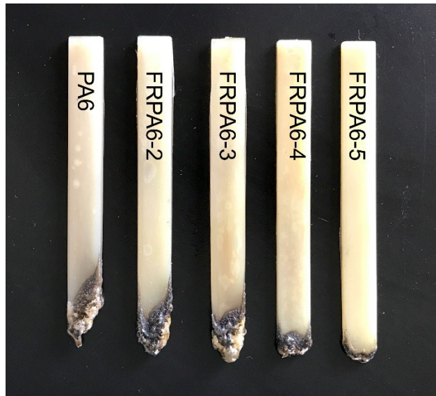
Figure S1. The photograph of PA6 and FRPA6 resins after vertical burning test