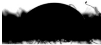
Fig. S2 The water contact angle of the pristine fabric. The water contact angle of the fabric is about 46°.