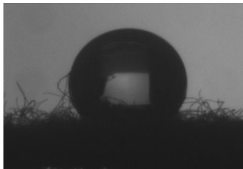
Fig. S3 The water contact angle of the fabric-(ODA@PDA) (after plasma treatment) at room temperature for one week without sun lights illumination.