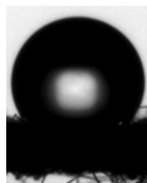
Fig. S4 The water contact angle of the fabric-(ODA@PDA) after washing (the fabric was dried under room temperature).