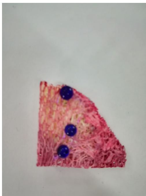
Fig.S2 Optical image of superhydrophobicity loofah sponge after 5 cycled oil-water separation