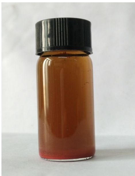
Fig. s2 Photo image of GO dispersion after being added Cu 2 O and siring for 10 min.