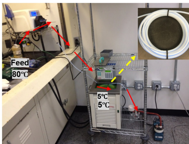
Fig. S1. Experimental setup of a plug flow crystallizer to prepare form II CBZ