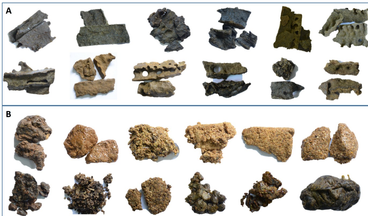
Figure S2. 12 batches of Brazilian green propolis samples (A) and 12 batches of Chinese propolis samples (B) tested in current study.