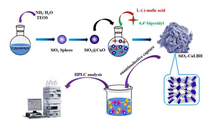
Fig. S2 Preparation of SiO<sub>2</sub>-CuLBH