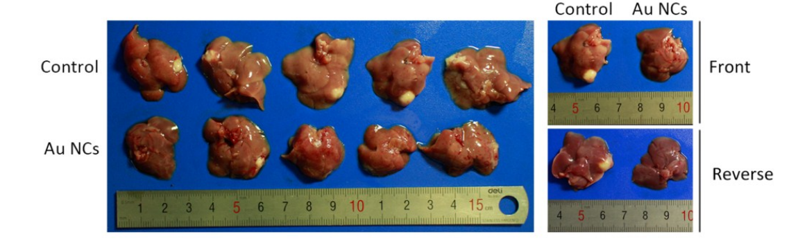
Figure 2. Ex vivo images of all orthotropic tumors in livers on day 38 after relevant injections. Representative images of liver are on the right, and tumors were pointed out by red arrow.