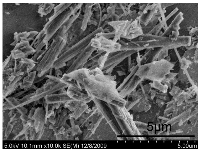
Fig. 1S SEM image of mullite obtained in the absence of B_2O_3 .