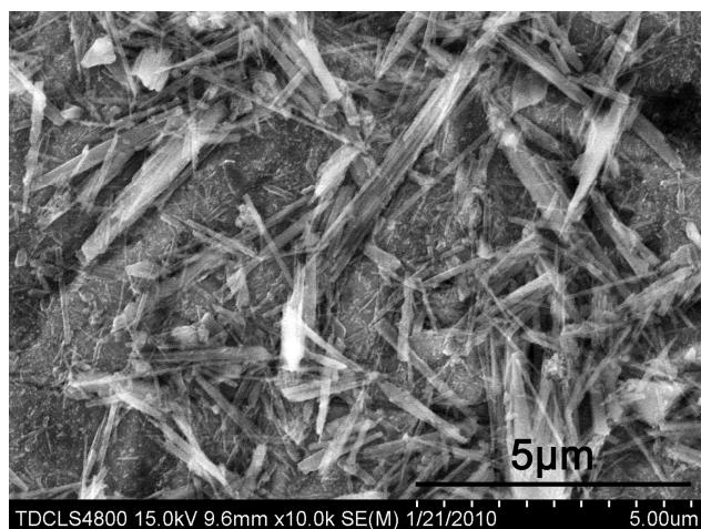
Fig. 2S SEM image of mullite obtained when the the molar ratio of B_2O_3/SiO_2 was 0.05: 6.