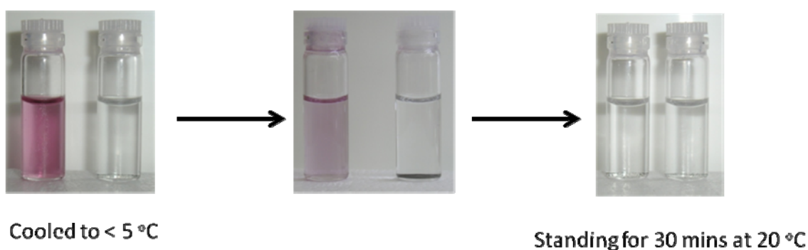
Figure S1. Photographs demonstrating the aggregation of POEGMA-coated gold nanoparticles in response to temperature changes.

Poly(OEGMA) with a cloud point of 26 °C, added to 12 nm AuNP at 20 °C. Within 20 minutes the colour has changed to blue (central image) indicating aggregation of the particles. This shows that the cloud of the particle is below that of the free polymer, as a stable unaggregated gold dispersion is red in colour. If this was allowed to stand for 30 minutes at 20 °C full precipitation occurred and all colour from solution has been removed. Conversely, if this sample is cooled to 5 °C, resolubilisation occurs demonstrating reversibility.