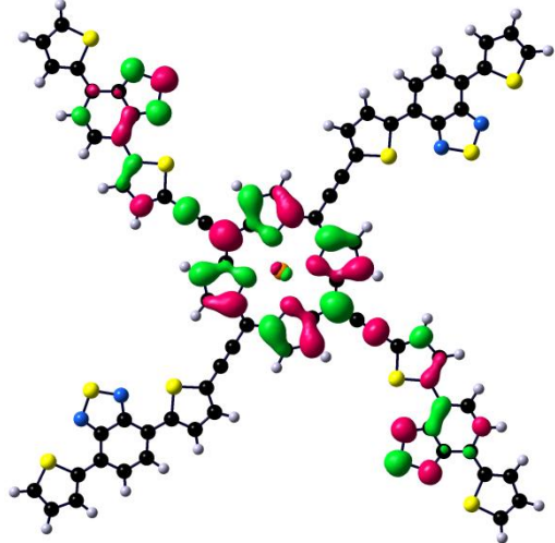
LUMO+5( \beta )