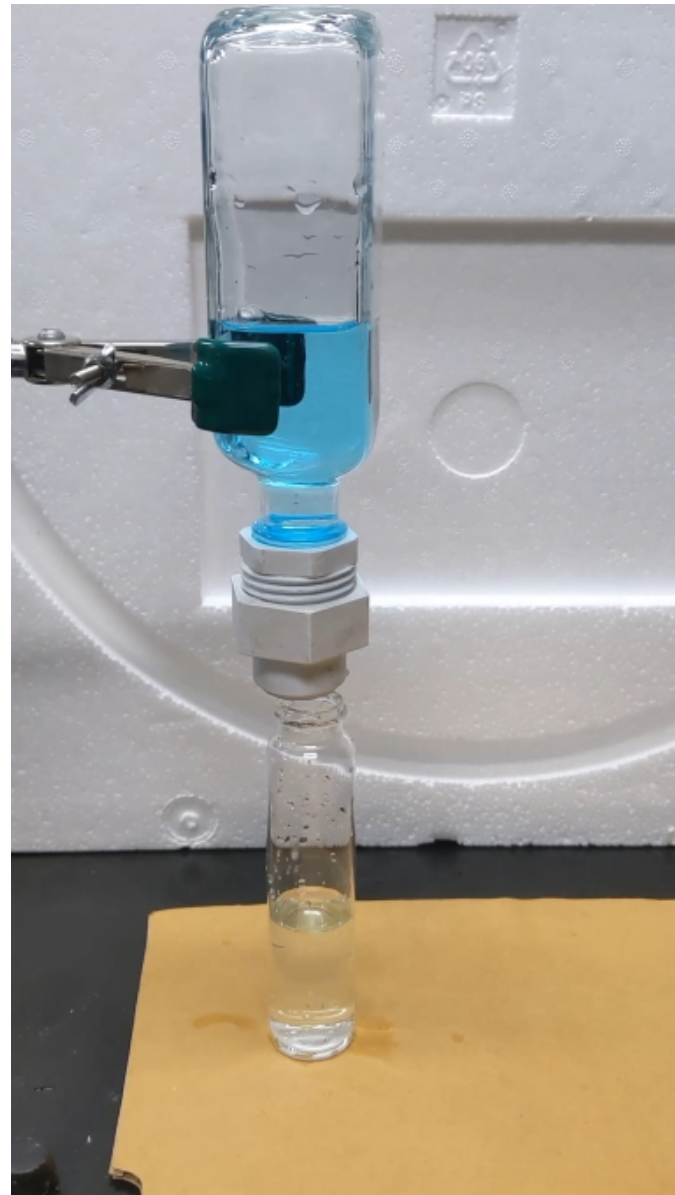
Movie S3. Demonstration of Fixed Bed Adsorption Study