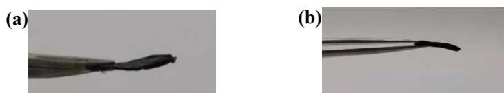
Figure S1. The images of CNTA@SF and CNTA@C recovering to initial state.

* E-mail: zhangxiaohua@suda.edu.cn; yangzhaohui@suda.edu.cn