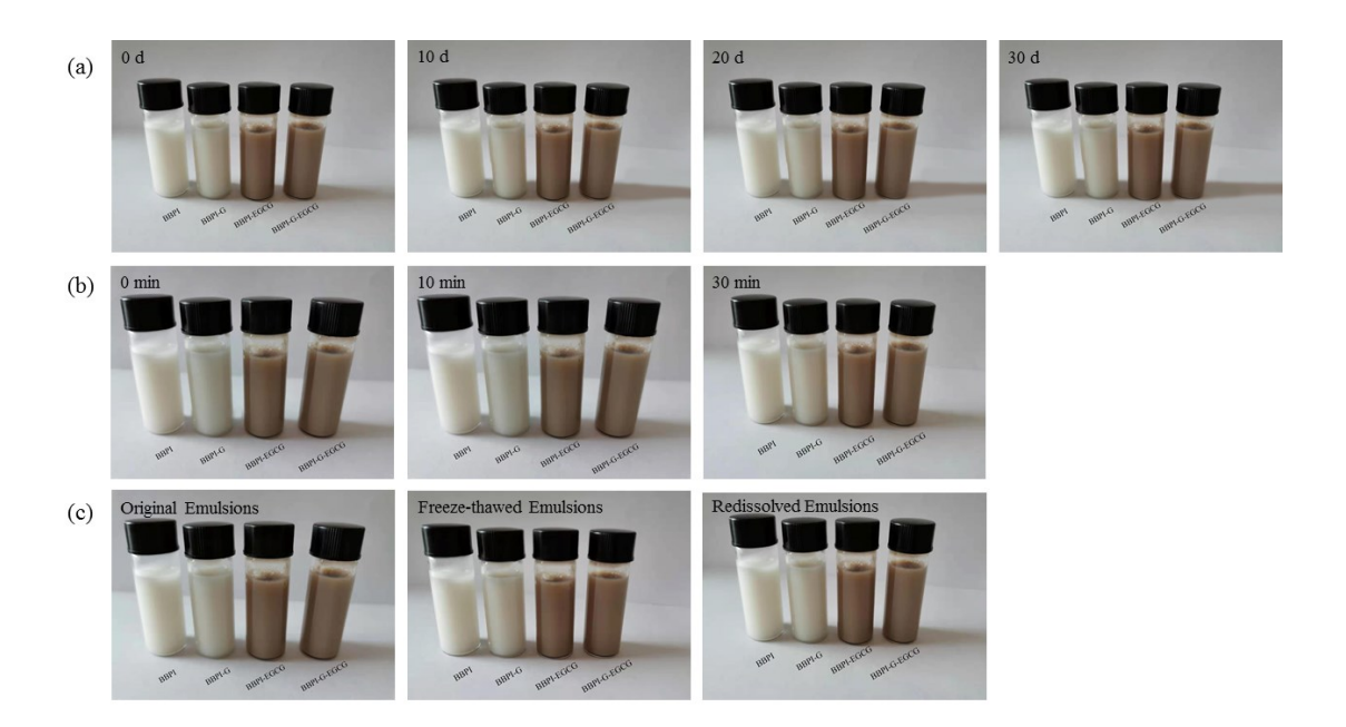
Supplementary Fig. S3 Appearance of emulsions. (a) is emulsions with different storage time (day). (b) is emulsions with different heating time (min). (c) is original emulsions, freeze-thawed emulsions and redissolved emulsions.