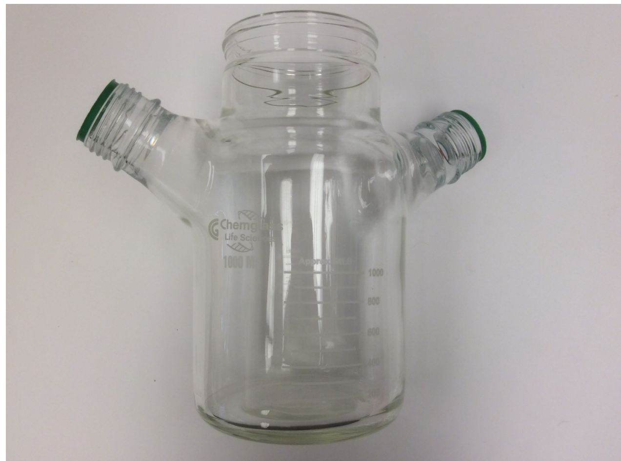
1 liter spinner flask