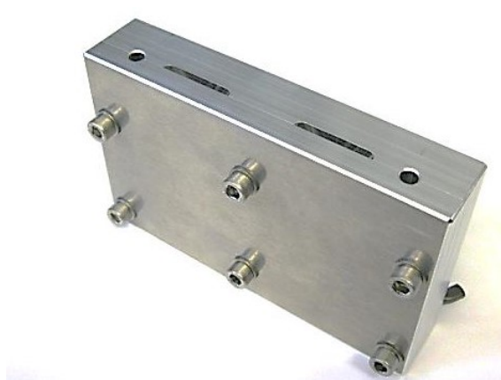
Fig. S 1 Aluminium mold used to cast EP and UP samples, 40 mm diameter cavities, a) mold open, b) mold closed.