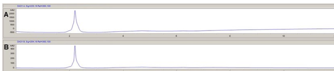
Figure S2. Liquid chromatography spectra of A) KLD-V1, and B) KLD-V2

Supplementary Table S1. Sequences, observed and calculated molecular weight of synthesized peptides