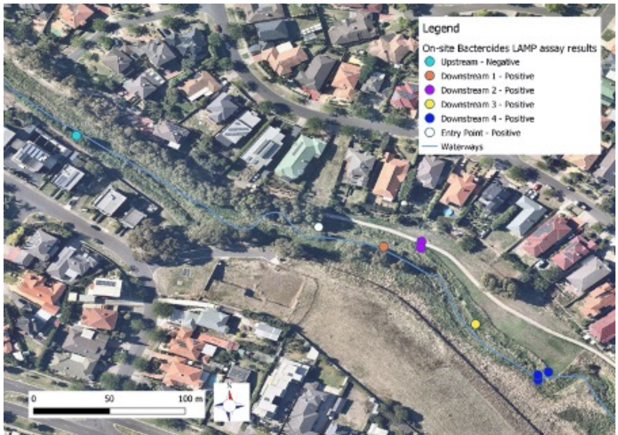
Supplementary Figure 3. Testing Location on Greenville Creek, Victoria, Australia