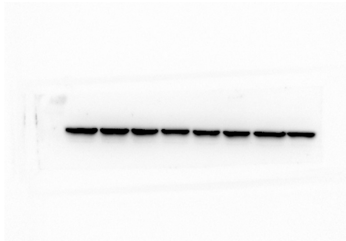
Figure3. Original picture of the \alpha -tubulin western blot (the first four wells were spiked with no perillartine, and the last four wells were spiked with 75 \mu M perillartine)