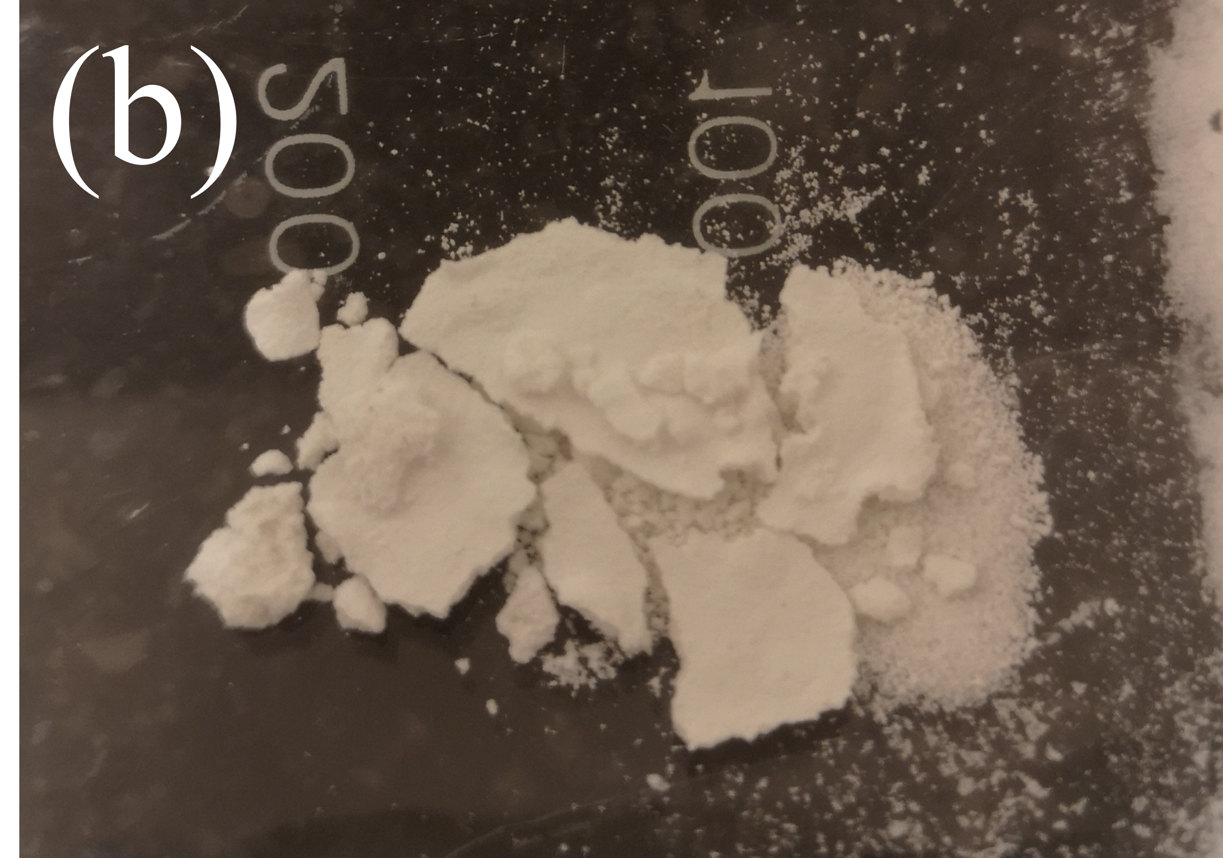
[ PS- b -PMVS PS- b -PMVS- b -PS PS