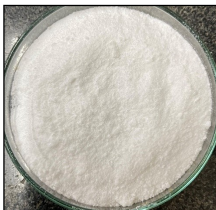
Figure: Prepared ZnO nanoparticles