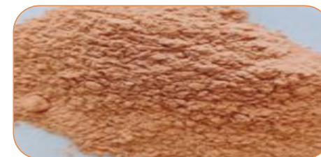
Heiyai SFE spent