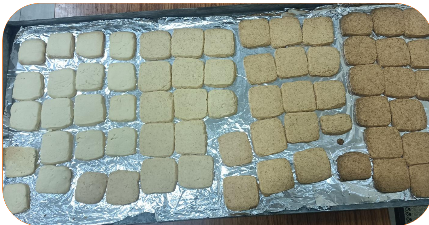
Figure S1: Cookies incorporated with Heiyai SFE spent powder at different levels 0,2%, 5%, 10% and 15%(w/w)