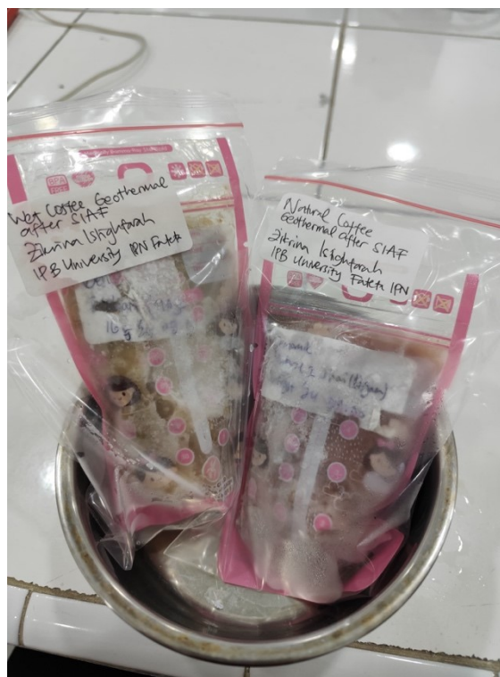
Supplement Figure 5 Nitrogen frozen of green bean sample for chemical analysis (left) and frozen samples of DNA shield submerged green bean for metagenomic analysis (right)