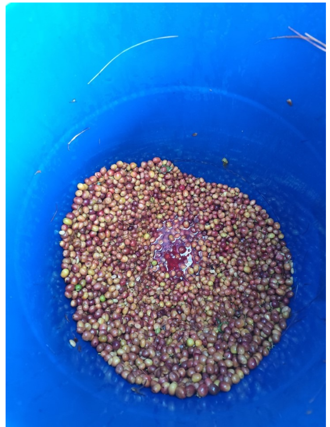
Supplement Figure 3 Self-Induced Anaerobic Fermentation of Pulped (right above) and Whole (right below) Cherries SIAF in the bioreactors (left)