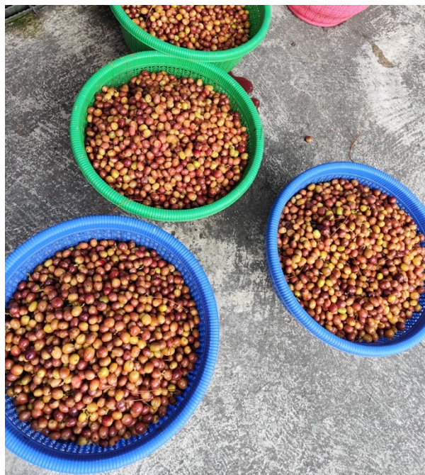
Supplement Figure 4 Pulped (left) and Whole (right) coffee cherries after SIAF