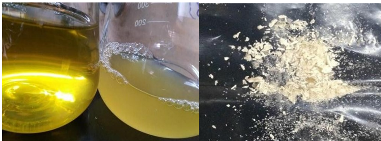
Figure S5: Synthesis of ZnO NPs by A) S. mutans B) confirmation of powder form of ZnO NPs.