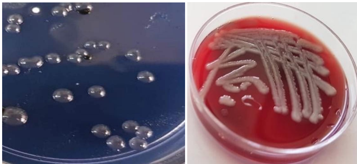
Figure S4: S. mitis on a) M. Salivarius Agar, b) on blood agar