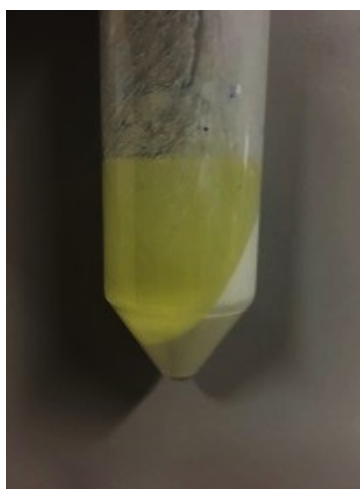
Figure S1: Digital photograph of the as-prepared suspension after centrifugation for 5 min at 4000 rpm.

*Corresponding author: nhphuc@hcmut.edu.vn (NHH. Phuc)