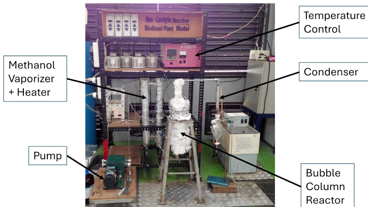
S1. The experimental set up used in this research

*Corresponding author: arispurwanto@apps.ipb.ac.id