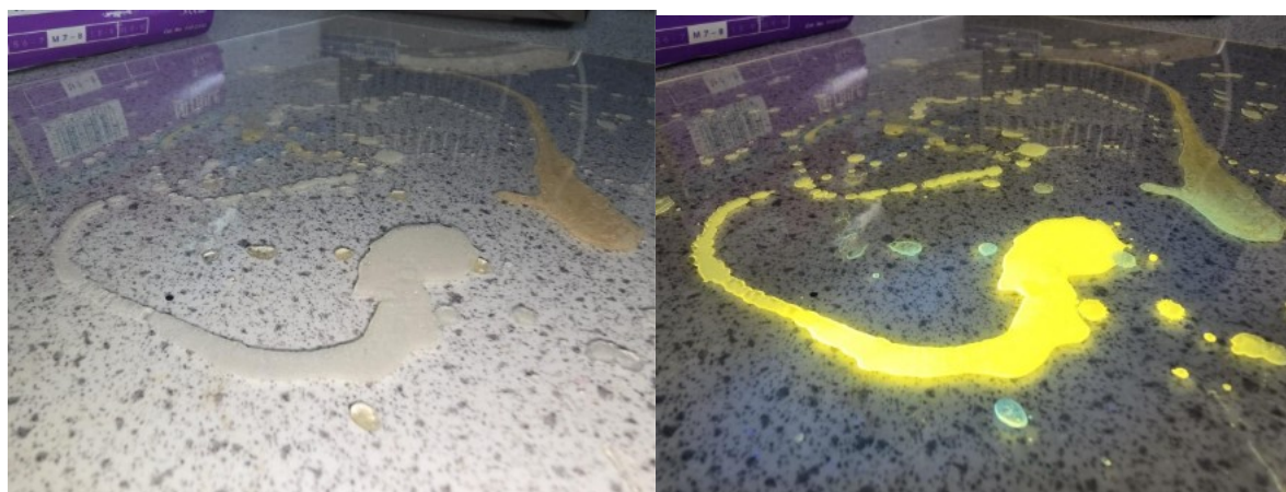
Supplementary Figure 2. Photographs of solid samples of [Cu 4 I 4 (PPh 2 Et) 4 ] (left) and their emission under 365 nm UV excitation (right).