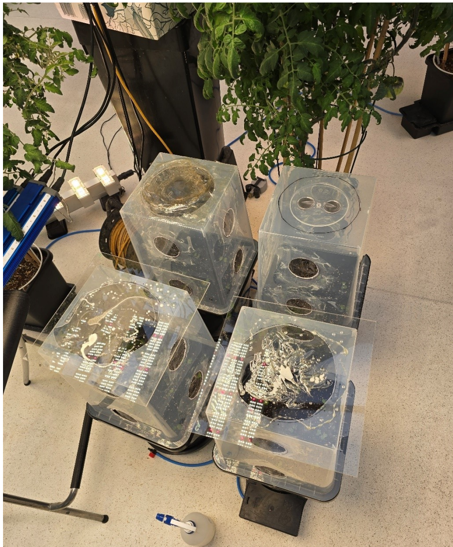
Supplementary Figure 3. Indirect trial setup at AutoPotUK. Back left is the modified chamber using CA/Cu-CNA, back right is the control using the original Autopot polypropylene chamber, front left is the [\text{Cu}_4\text{I}_4(\text{PPh}_2\text{Et})_4] coating and front right is the [\text{Cu}_4\text{I}_4(\text{PPh}_3)_4] coating.