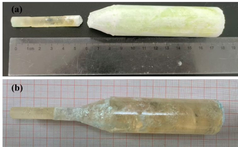
Figure S2 (a) Polycrystalline crystal obtained at a lower seeding temperature, (b) cracked crystal formed under a faster cooling rate.