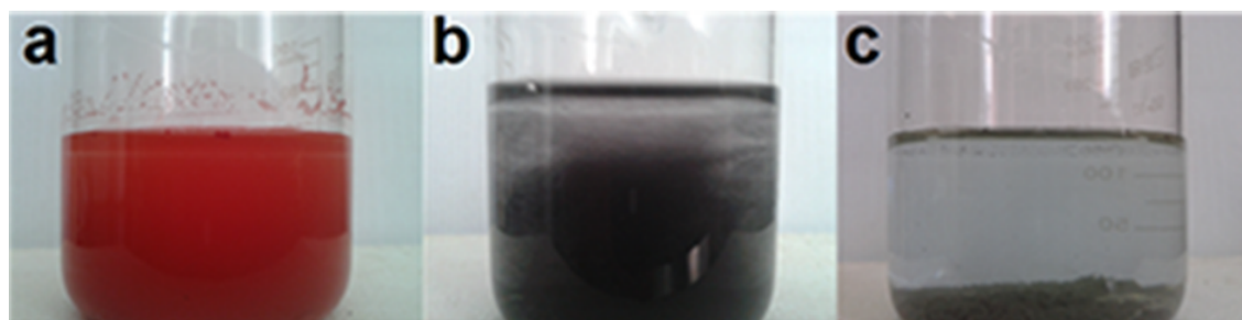
Figure. S2 The photographs of sample-containing solution: (a) \text{Cu}_2\text{O} , (b) \text{Cu}_7\text{S}_4 (c) \text{Ag}/\text{Ag}_2\text{S}/\text{Ag}_3\text{CuS}_2 .