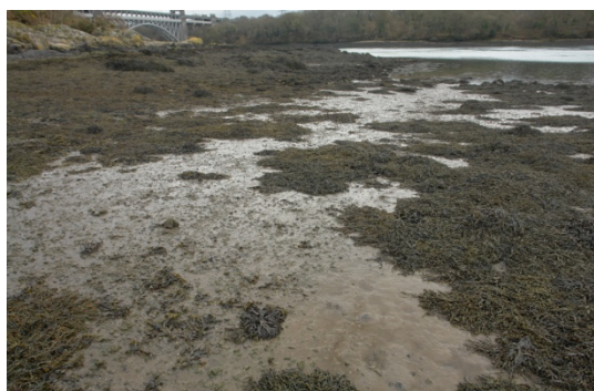
St. Mary's Church with discharge on opposite side of the Menai Strait (250 m)