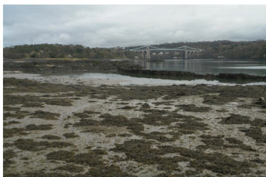
Between the Bridges, The Swellies, with Menai Bridge in the background (1000 m)