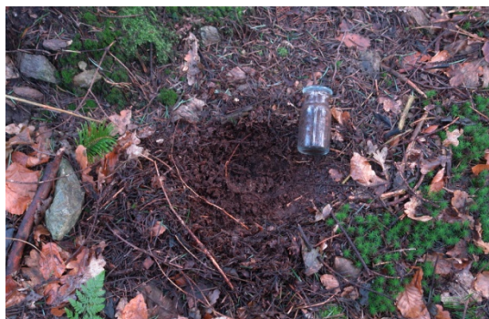
Coniferous woodland soil