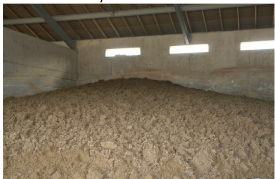
Sludge samples were collected from the holding bays after lime treatment