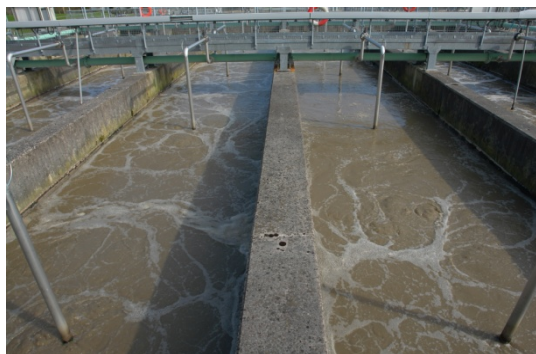
Post primary settlement samples were collected at the start of the oxidation ditch