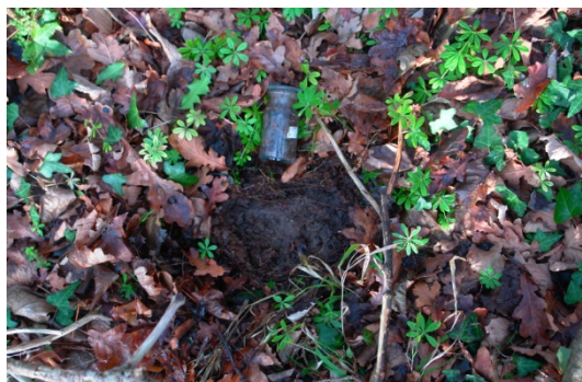
Deciduous (oak) woodland soil