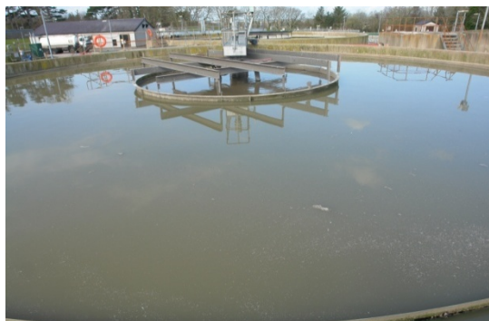
Influent samples were collected from the central feed to this primary settlement tank