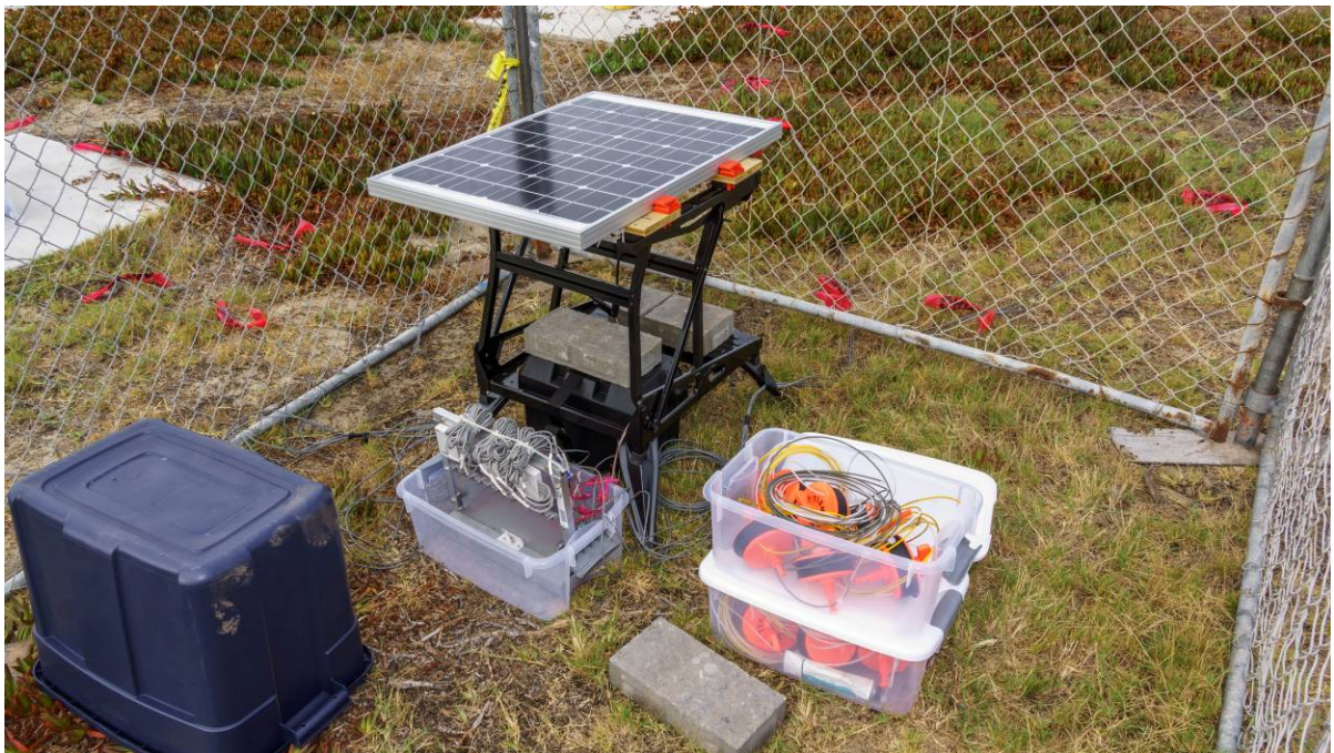
Collection system before deployment