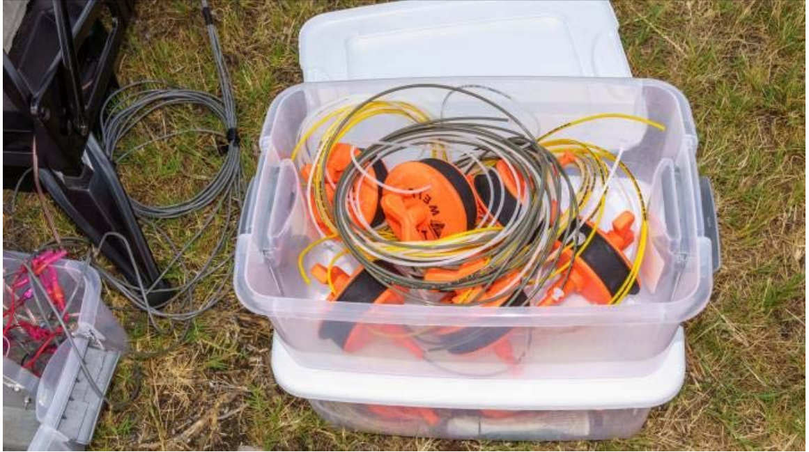
Modified well caps (sealed sample and return lines)