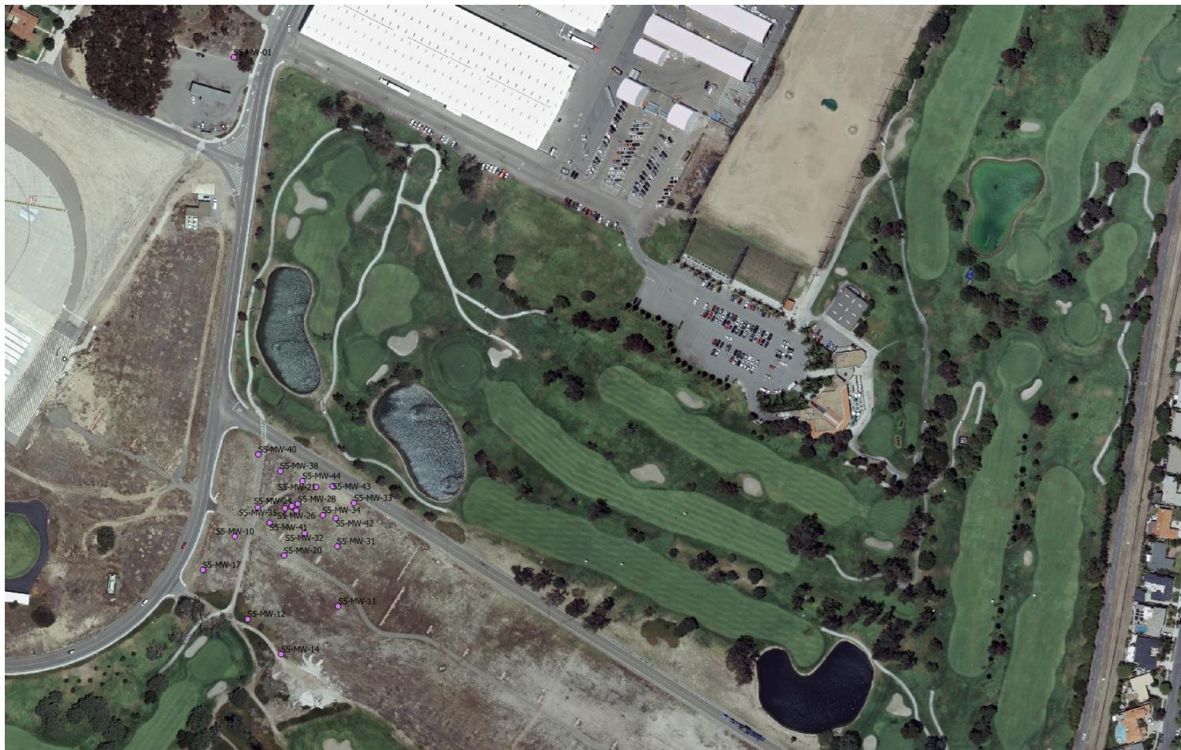
Entire site - S5-MW-01 upper left