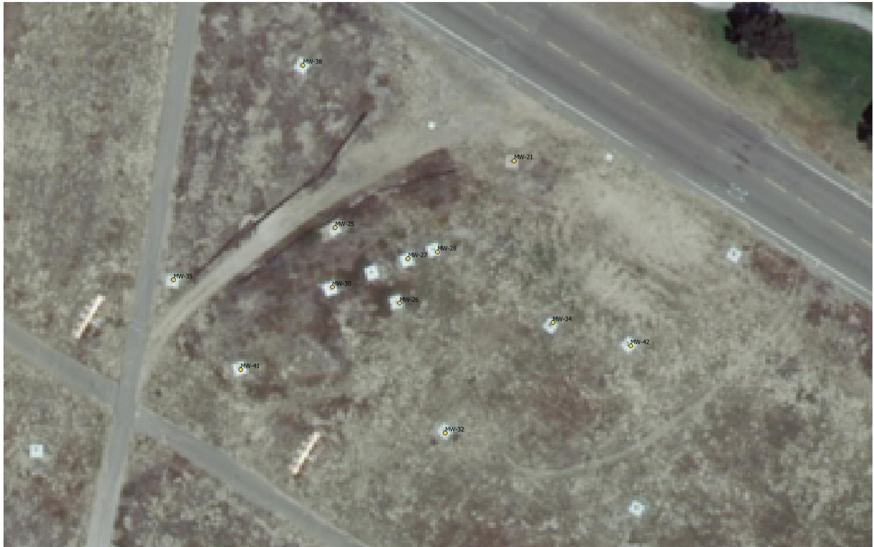
Central well cluster (July-August 2013 sampling)