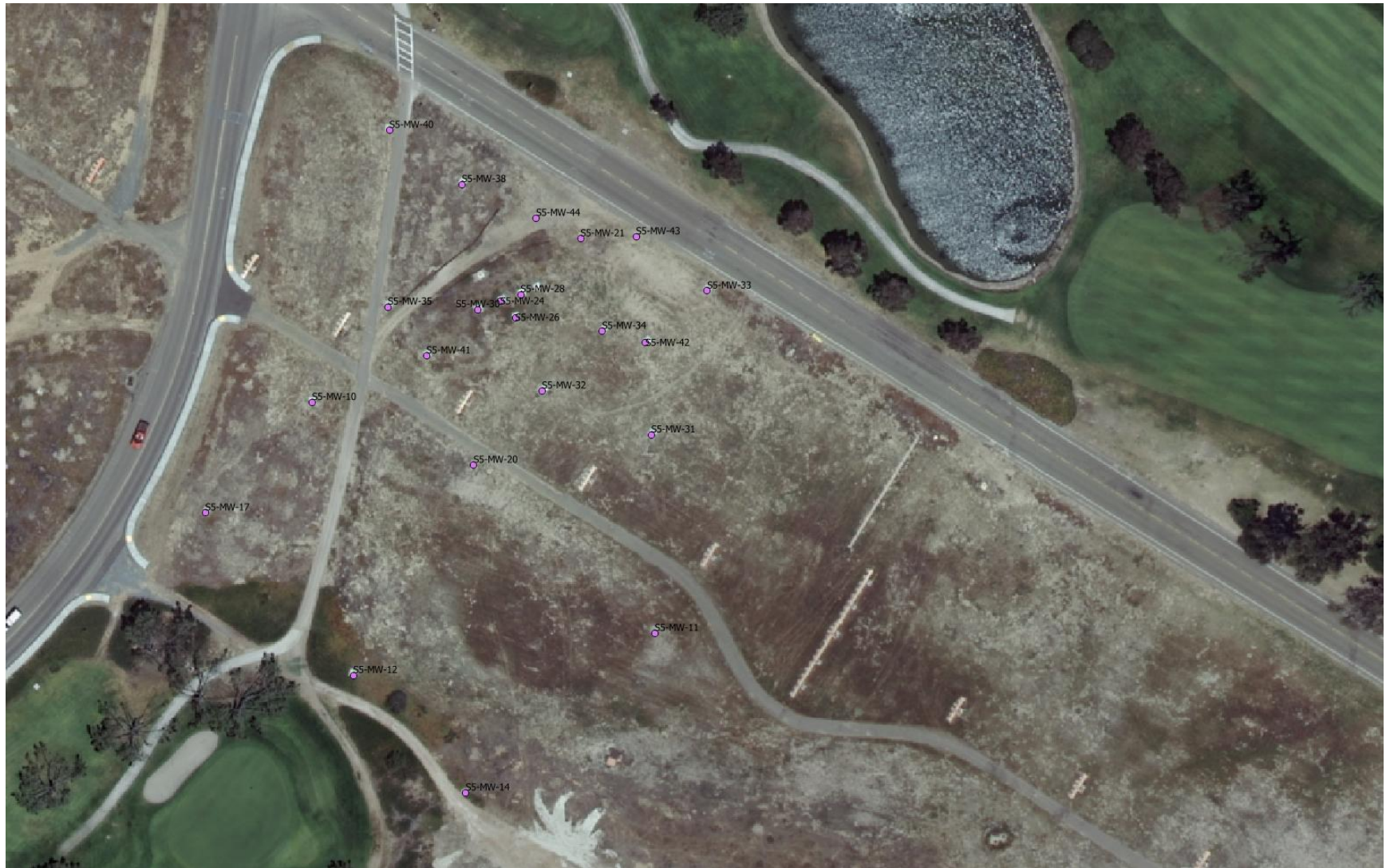
Central site - wells sampled March 2013 for cations