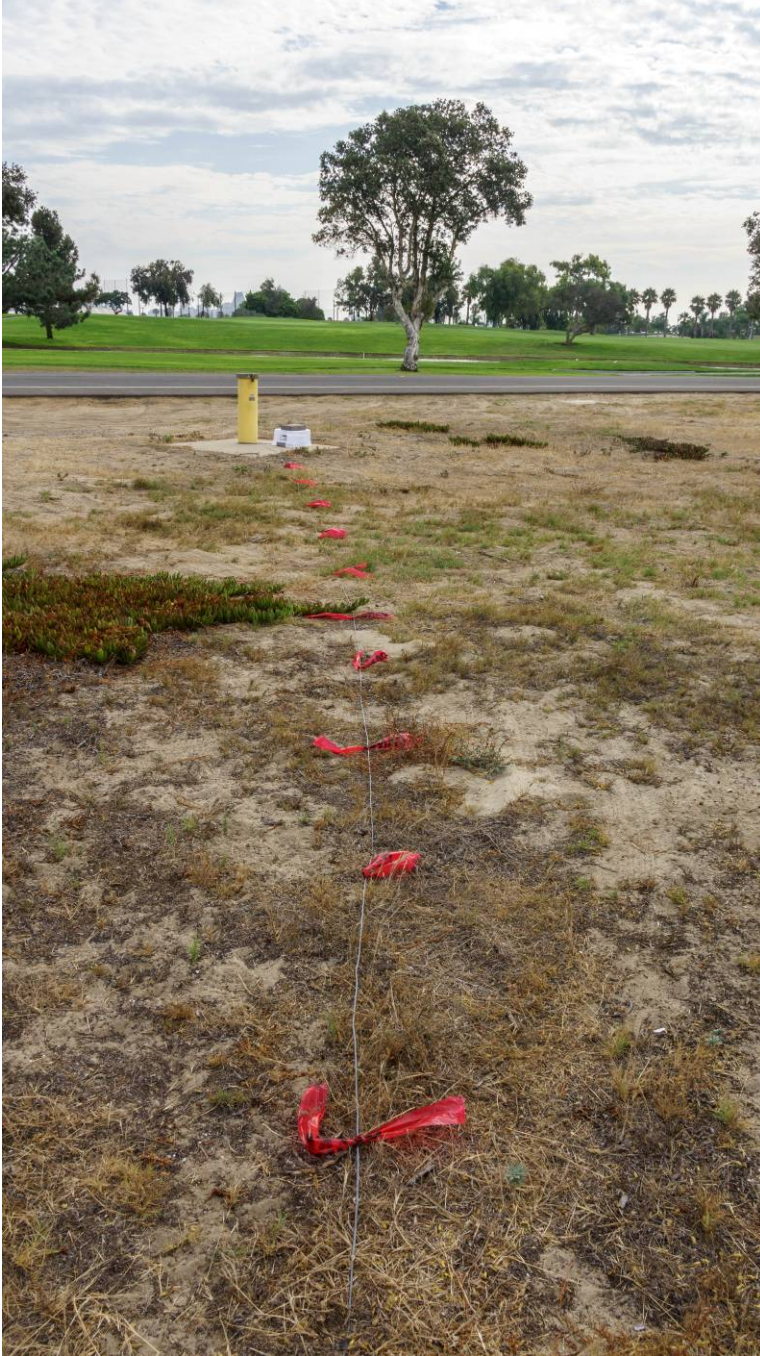
Wiring from control unit to well