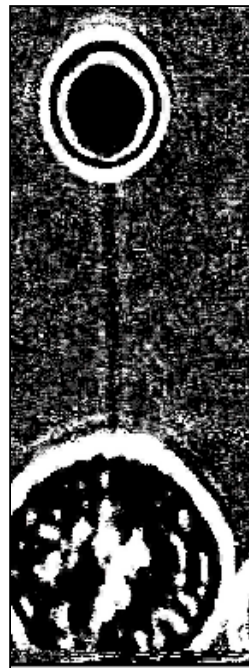
Stationary (7 fps)