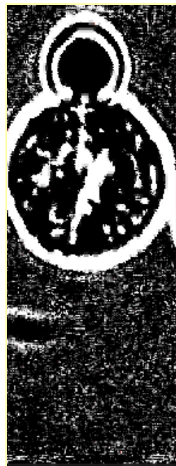
Formation (30 fps)