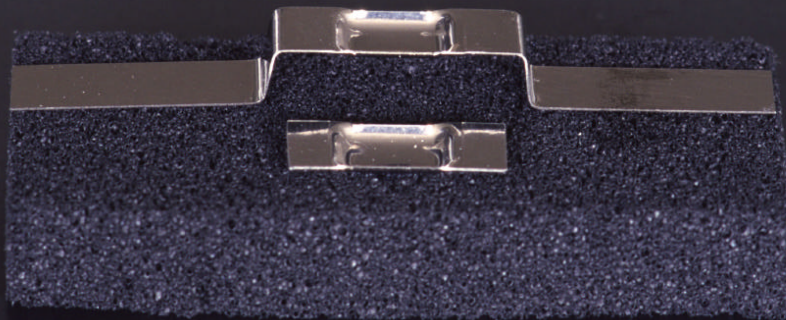
Fig. S1 Sample cuvette and tungsten boat furnace