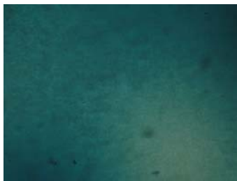
ESI Fig. S1 Photomicrographs of (a) the blue phase at 71°C of compound 1 and (b) that after being sheared.