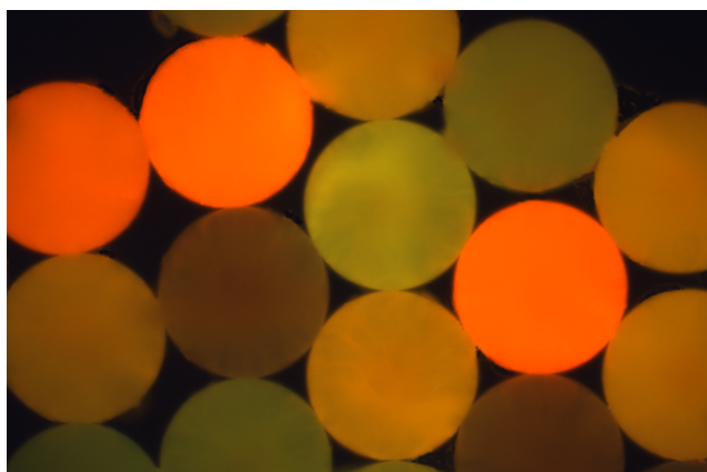
Figure S2. Fluorescence micrograph of a mixture of different colors CdTe QDs deposited onto SCCBs.