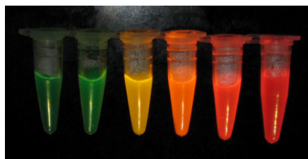
Figure S1. The photograph of brightly emitting CdTe QDs of different sizes taken under UV-lamp excitation.