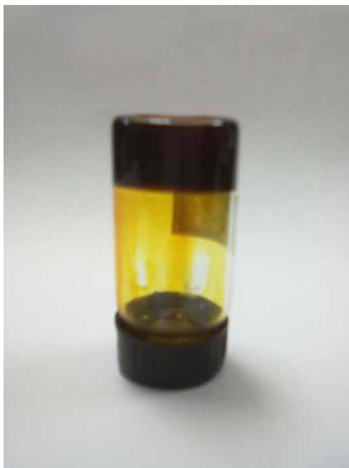
Figure s1: image of quasi-solid PEO gel electrolyte, the bottle is up-side down.