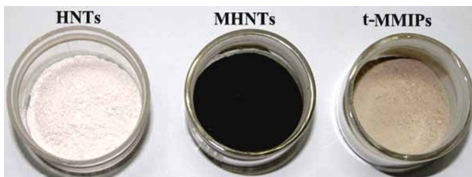
Figure ES11 Photographs of HNTs, MHNTs and t-MMIPs.