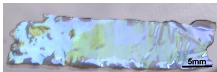
Figure S2. The image illustrating the physical aspect of the LCEs based inverse opaline film. The bars in the images stand for 5 mm.