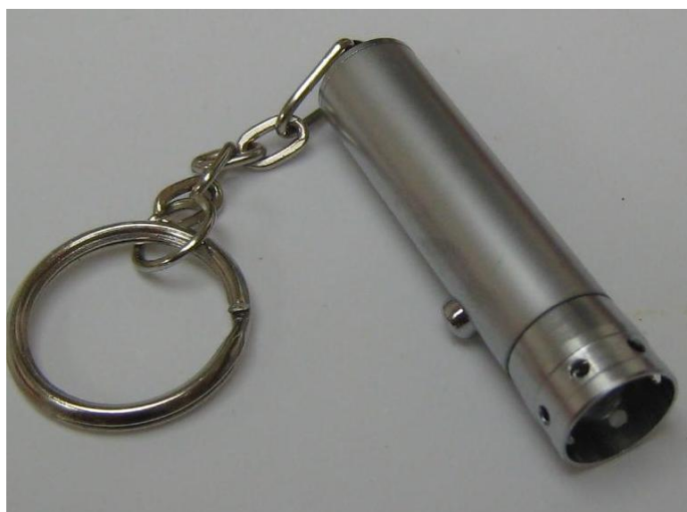
Fig. S4: A photograph of the reusable, mini keychain UV light source for fluorescent excitation (PickEgg Ltd, Hong Kong, $2)