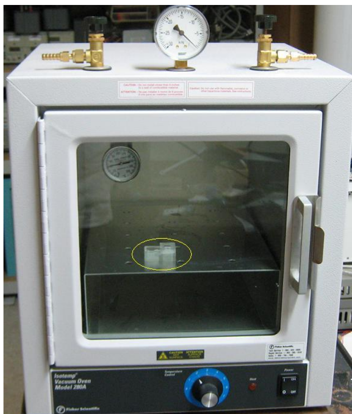
Fig. S3: To simulate various ambient temperatures, experiments were carried out in an oven (Isotemp Vacuum Oven Model 280A, Fisher Scientific Inc., Pittsburgh, PA)