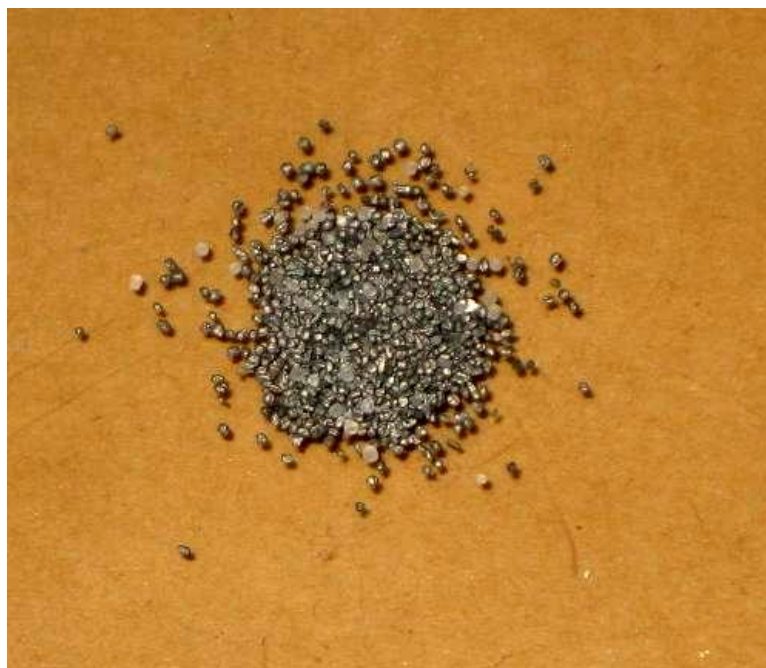
Fig. S1: A photograph of Mg-Fe alloy used in the exothermic reactor