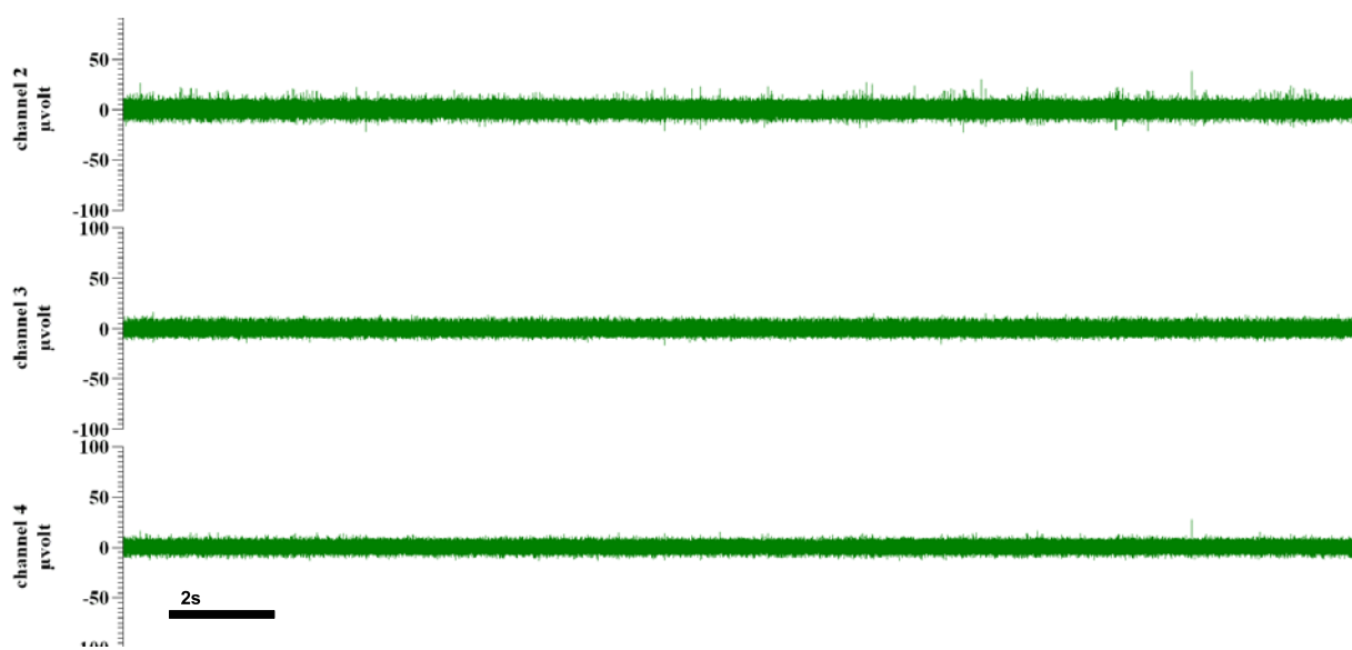
Supplementary figure 3. Recordings from three cut L6 rootlets in three micro-channels. During the recordings, constant cutaneous stimulation is applied at the base of the tail of the anaesthetized rat. However, as the rootlets are cut, no activity is recorded.