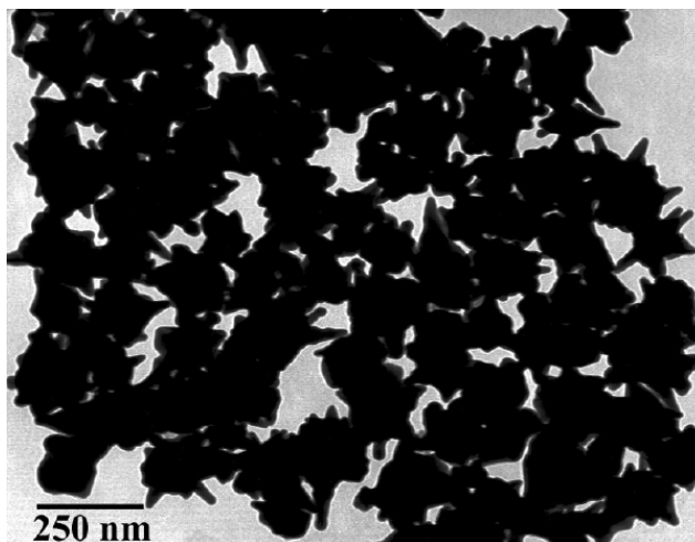
Fig. S2. TEM image of \text{Fe}_3\text{O}_4@\text{GNSs} after running for 6 cycles by magnetic separation.