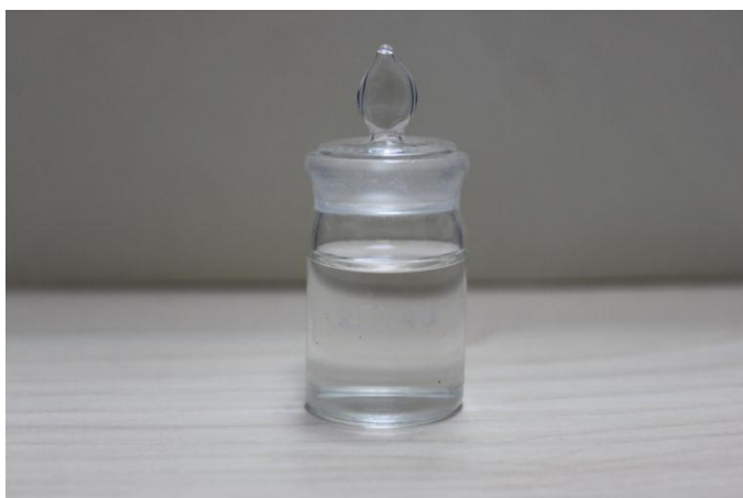
S4 Digital micrograph of the water solution detrived from Soxhlet extracting WCF for 24 h