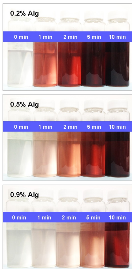
Fig. S1 AuNPs–alginate aqueous suspensions prepared from alginate solution of different concentrations and SPS discharge times.